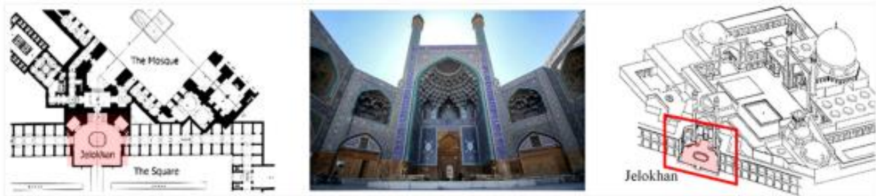
Figure 2. In-between space at the entrance section of the Shah (Imam) Mosque in Nagsh-e Jahan Square, Isfahan–jelokhan [16].

Keywords: Contemporary architecture, borders, in-between space, traditional architecture.