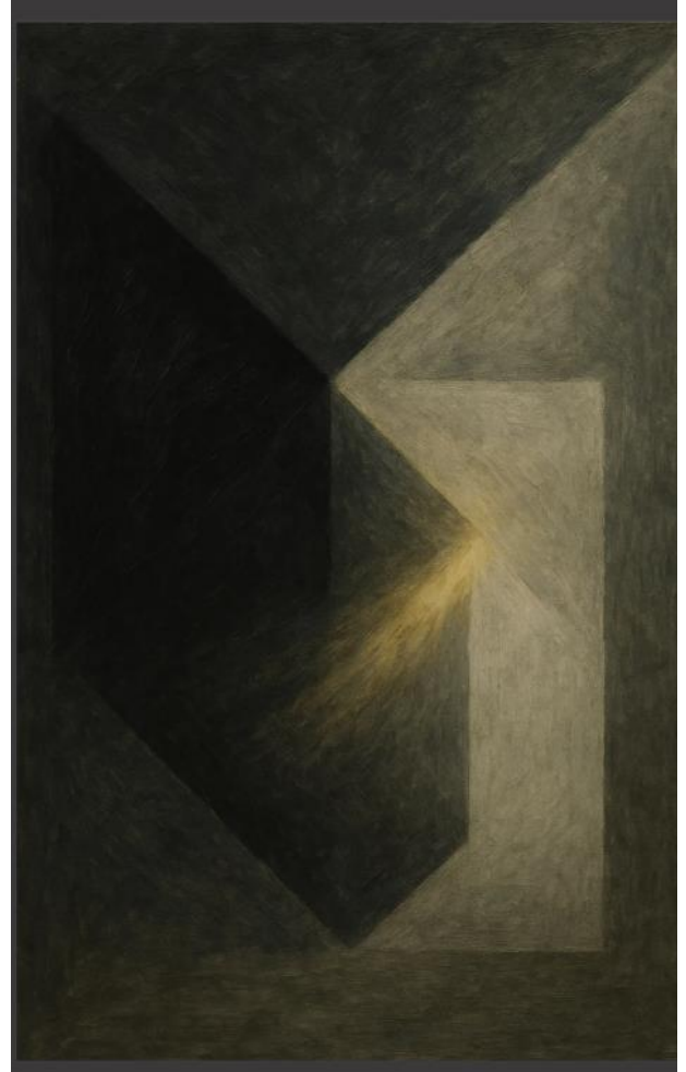
Umudun Yok Oluşu , 750mmx1150mm, 2025