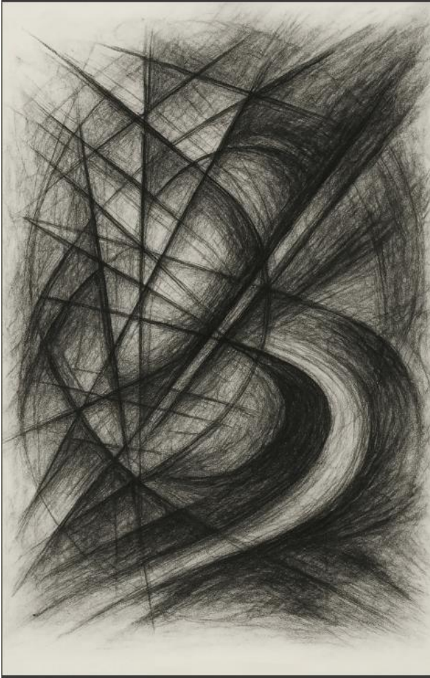
Zamanın Sesi , 625x940mm, 2025