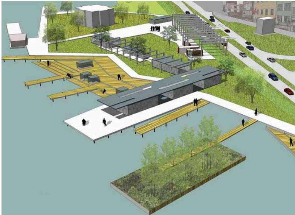
Proposed Open Space Use for Fener-Balat Coastline