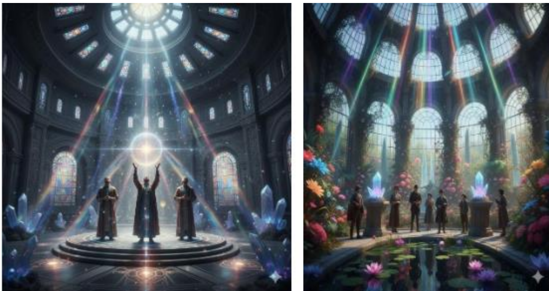
Artificial intelligence scenes generated from fantasy movie scenes