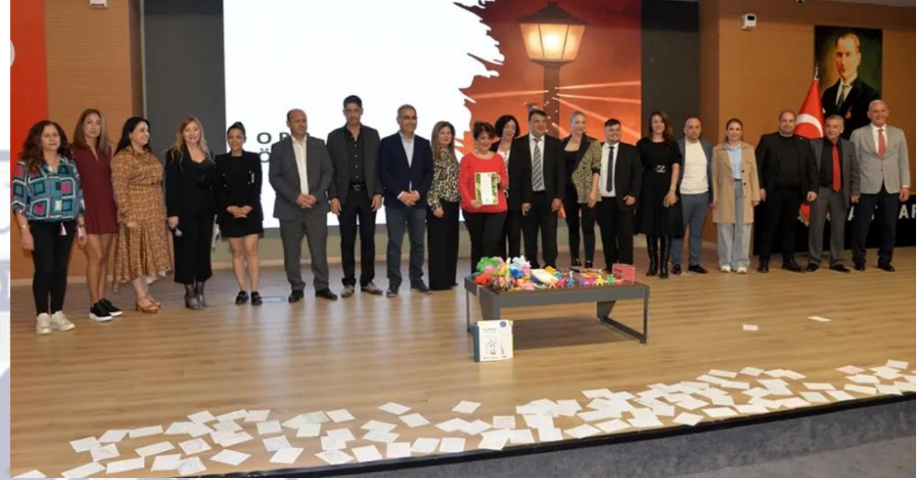
Adana'da Okul Öncesi Eğitimciler Sempozyumda Buluştu