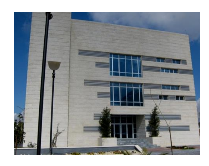
Information Systems and Technology Center