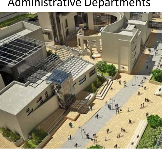
Library and Knowledge Center