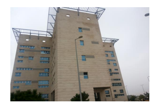
School of Basic Sciences and Humanities