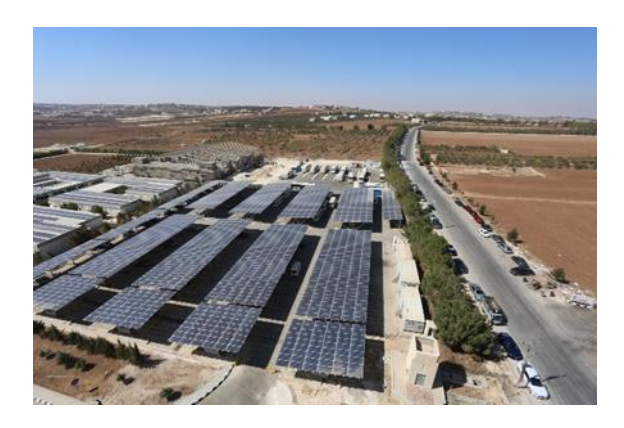
Parking for 300 cars