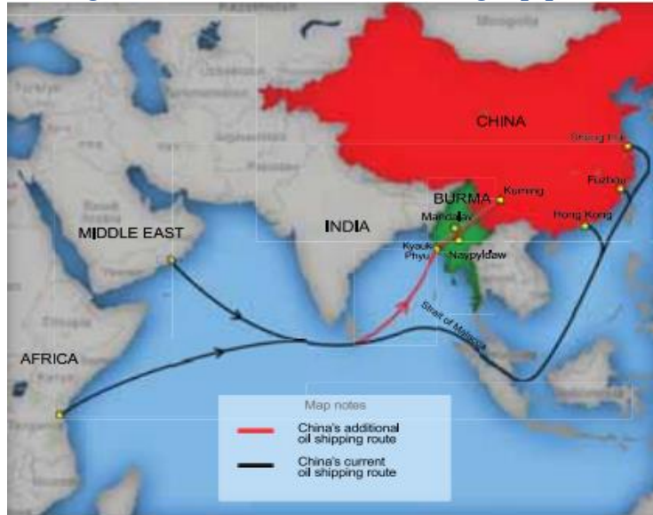
Image Trans-Burma oil corridor and gas pipelines

Source: Shwe, “Corridor of Power: China’s Trans-Burma Oil and Gas Pipelines”, http://www.shwe.org/wp-content/uploads/2011/03/CorridorofPower.pdf [17.07.2017].