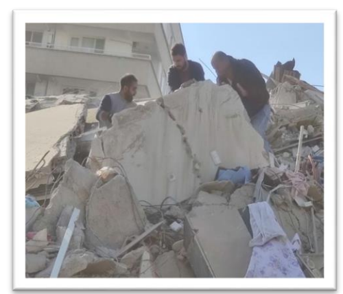
Image: <u>https://www.haberturk.com/izmir-</u> <u>deprem-goruntuleri-30-ekim-izmir-</u> depreminden-sonra-ilk-goruntuler-2853696/2