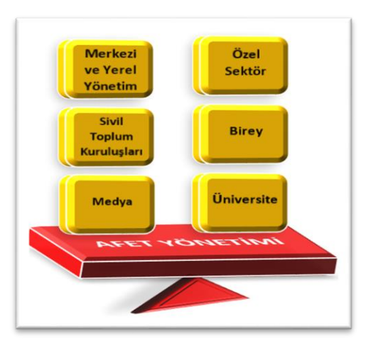
Responsibilities in Disasters