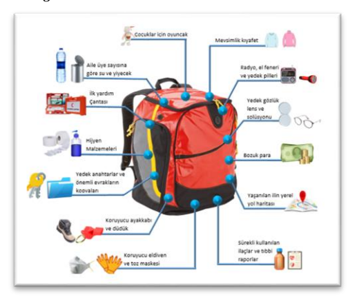
Disaster Emergency Kit