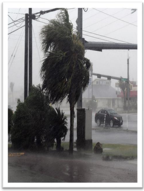
Hurricane Windstorm, 2017, Texas, USA.