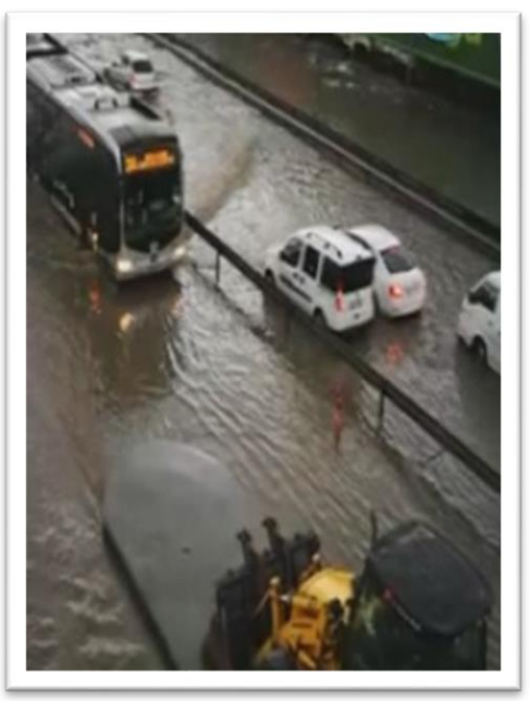
Istanbul Flood, 2017, Istanbul, Turkey.