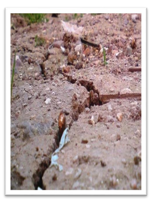
Drought, 2014, Suluova - Amasya, Turkey.

how to tackle this problem still shows that either the decisions taken are wrong or if the decisions taken are correct, they cannot be implemented.