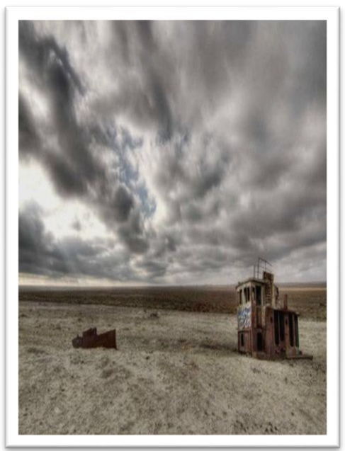
The Lake of Aral, 2015, Uzbekistan, Turkistan, Kazakstan.