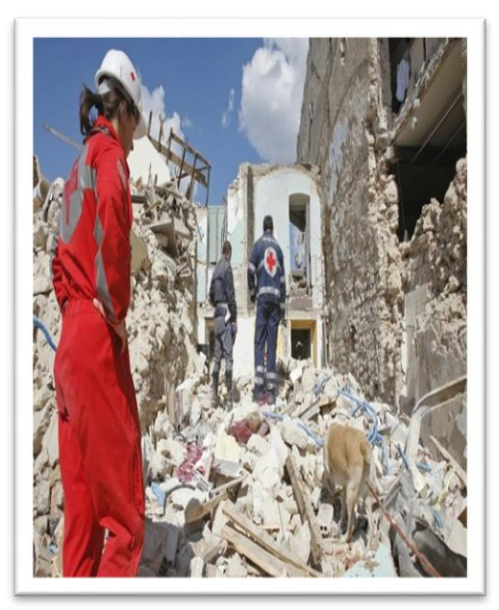
A view of a residential area after the Port-au-Prince Earthquake, January 12, 2010, Haiti.

1347 and 1351 or M.S. There are many examples in history, such as the changing building materials after the Great Fires of London in 1666.