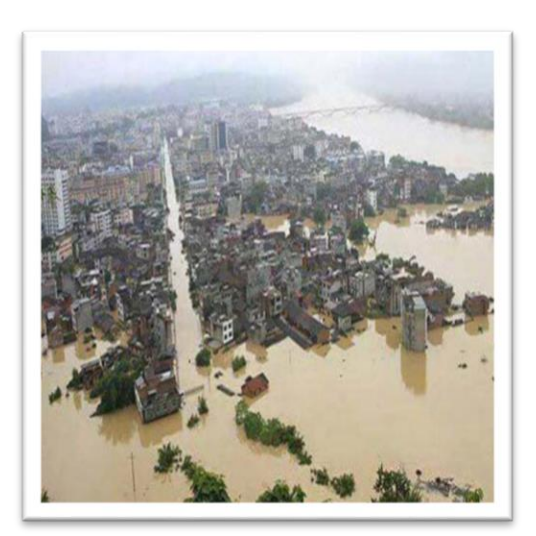
December 4, 2015, India, Tamil Nadu State Flood Disaster, View from Chennai City.