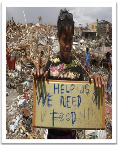
A view from the Visayas region after the Visayas Typhoon, November 11, 2013, Philippines.