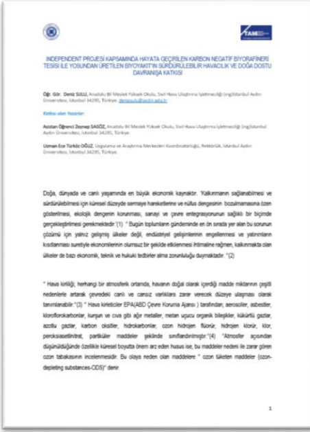
ABOUT THE INDEPENDENT PROJECT